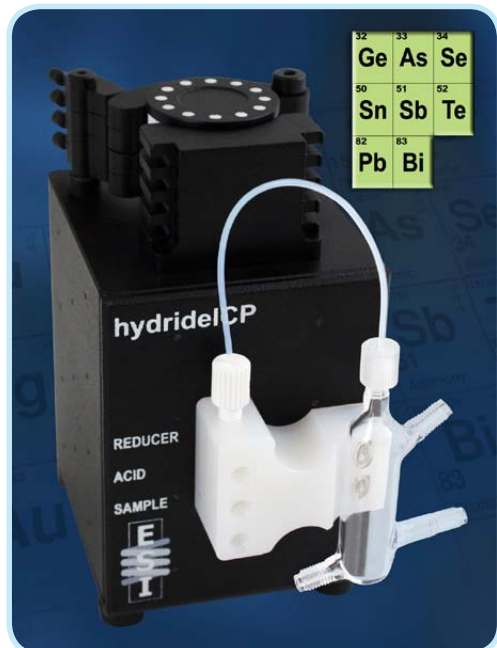
MP 2 hydrideICP Generation System